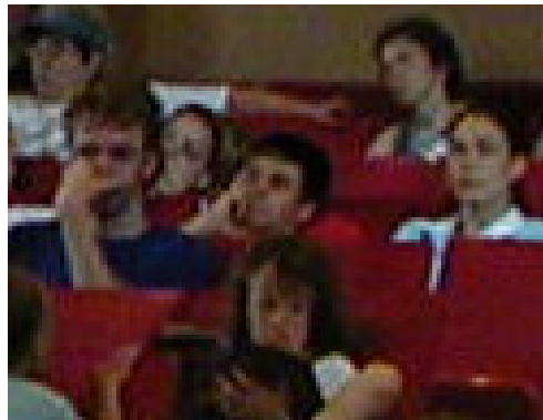
Nap workshop gets under way

Hope to see you there tomorrow. May the Z be with you.