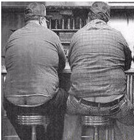
Our "crack" photographer found clear evidence of the Mobius Flip in use at SI

Your husband is correct in this matter. He of course is referring to a clothing conser-