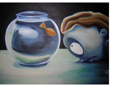
A disturbing thought, indeed...

The Tooth Fairies know perfectly well that their contract stipulates double payment for all lost teeth at ST, and simply because they must work A LITTLE HARDER to respond to all our dear SI children and their piles of lost teeth, is NO REASON to go to the media and create a