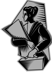
Newspaper thief? Not one of ours.

Apparently, newspaper distribution is more difficult than we thought. A certain newspaper which shall go nameless (but whose initials are Kinetoscope) has criticized our distribution methods and locations, but we have continued to get our message (should we ever find one) out to the public. Perhaps it was a garbage can, but it served.