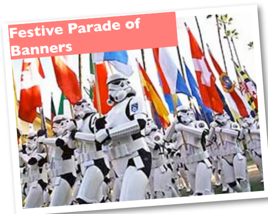
Festive Parade of Banners

share of chocolate chip cookies and ice cream during yesterday's dinner.