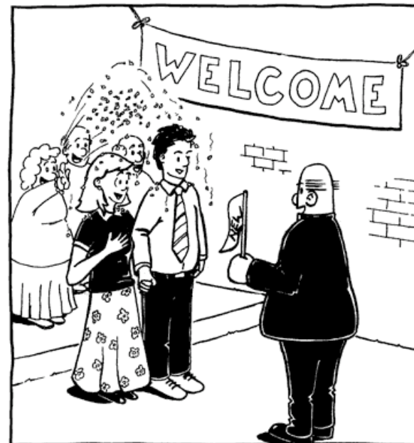
WE TEND TO GET A LITTLE EXCITED ABOUT NEW MEMBERS UNDER THE AGE OF SIXTY.

Really. The domain name was available, so I took it.