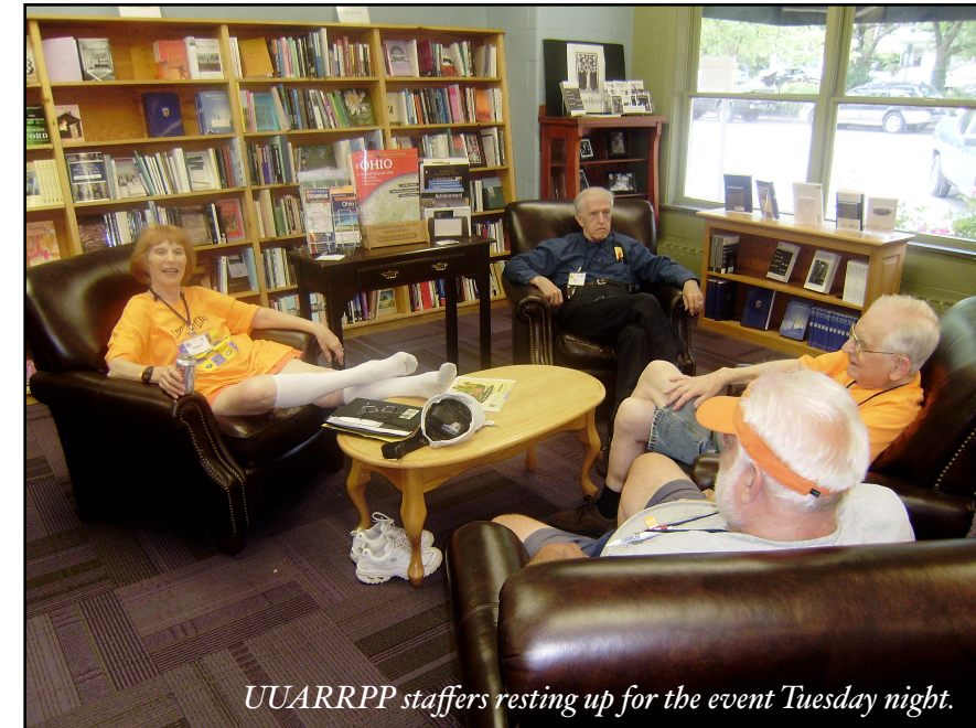
UUAARRPP staffers resting up for the event Tuesday night.

The Unitarian Universalist Association of Age-enhanced/ Really Retired People-Persons celebrated the inaugural bridging ceremony for "age-enhanced" persons in the SI community Tuesday night at 5:30pm. There is no specific numeric age one must attain to gain membership, but