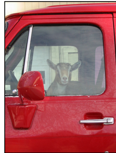
Maybe in the South you can make the goat ride in the back...