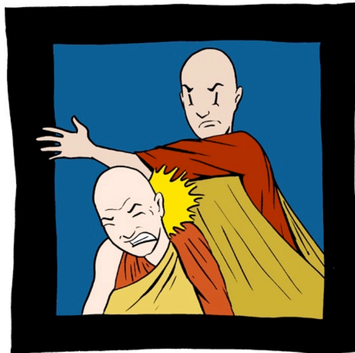
Monks who failed to achieve enlightenment were given the alternate answer to "what is the sound of one hand clapping?"

twice a year," and "Straight sex vs. Gay sex--if one's not working, give the other a try."