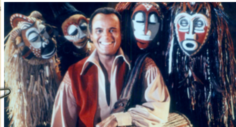
Harry Belafonte has no comment on the alternate version of the song "Turn the World Around" shown Sunday.

Really? Did Gollum write this? Do we really know who is on campus with us? And why?