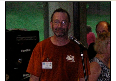
Possible sighting of G.I.M. Narley in the Snowden Center yesterday

Corporate Headquarters, new Pittsburgh North Church. PNC LEADING THE WAY