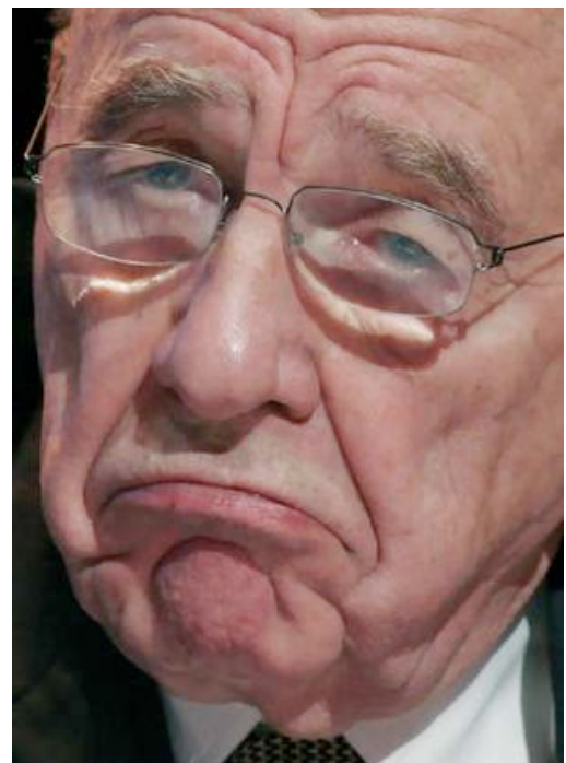
Chairman Murdoch expresses disappointment at losing liberal audience for Fox News.

local Murdoch operatives have tapped the Kenyon network, reading