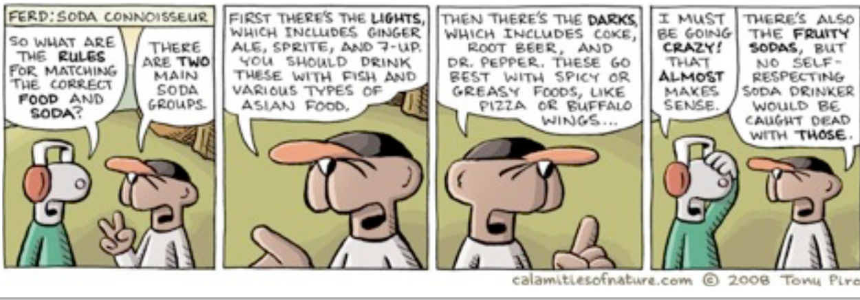
calamitiesofnature.com © 2008 Tony Piro